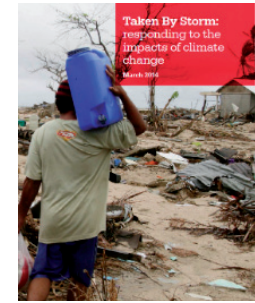
Christian Aid’s new report Taken by Storm chronicling the impact of climate change can be found at http://bit.ly/1mDalvN

On Monday, the Intergovernmental Panel on Climate Change released a report examining the reality of those